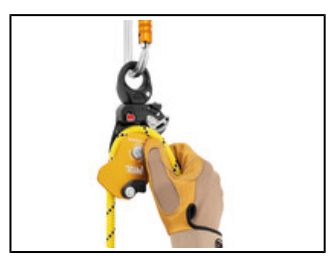
The rope may be installed in the PRO TRAXION pulley when the pulley is connected to the anchor.