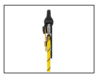
When the cam is locked in a raised position, it allows the PRO TRAXION to be used as a simple pulley.