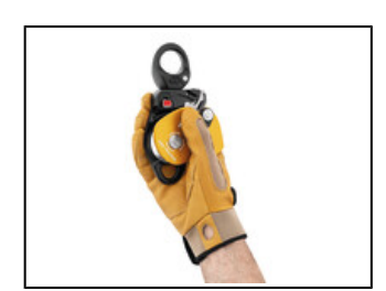
Triple-action opening of the moving side plate is quick and easy, even with gloves.

Possible to open, even when attached to the anchor, the PRO TRAXION progress-capture pulley is designed for setting up haul systems. With a large diameter sheave mounted on sealed ball bearings and excellent efficiency, it is particularly suitable for hauling heavy loads. The swivel makes it easier to operate, allowing the pulley to be oriented under load and for direct connection of carabiners, ropes, or slings.